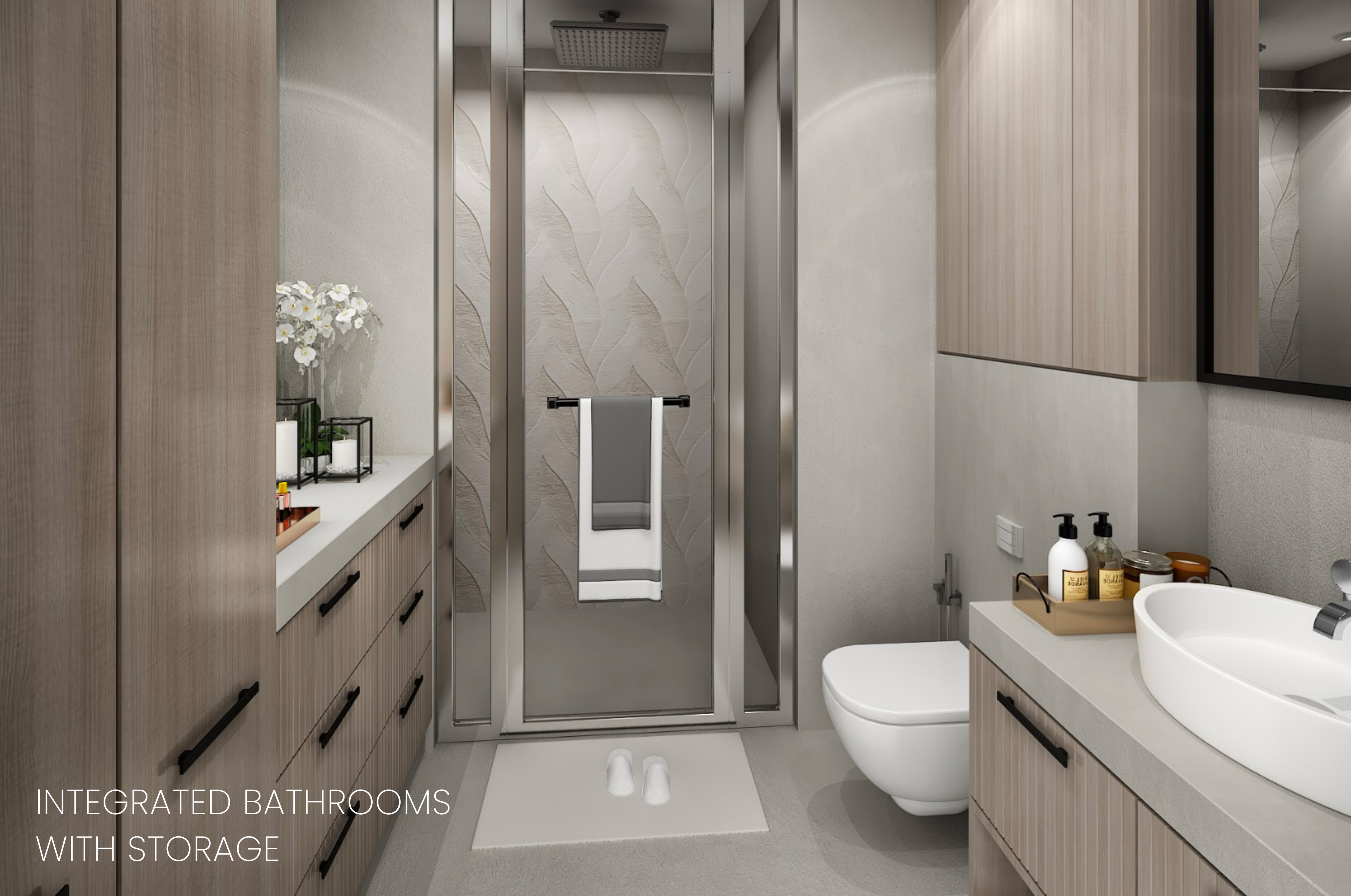
INTEGRATED BATHROOMS WITH STORAGE